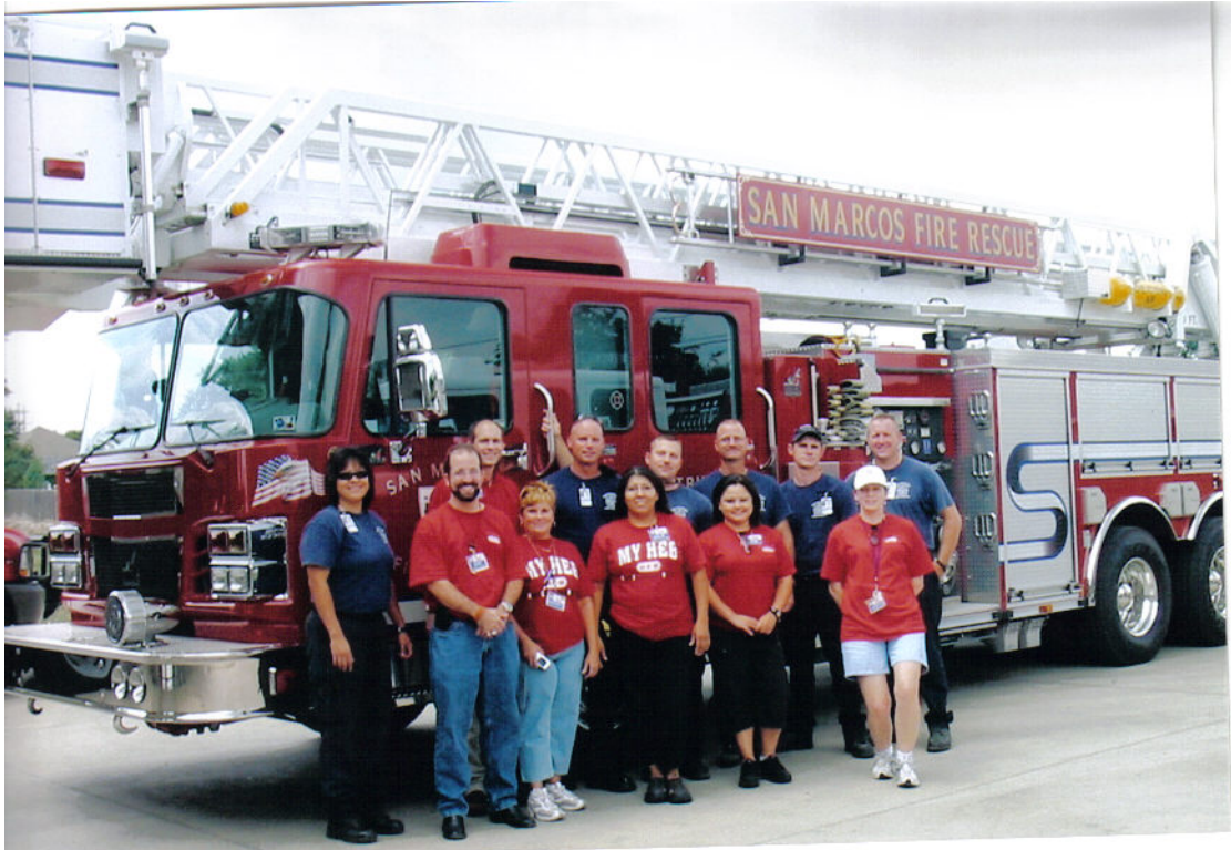
Partners from the local HEB's pose with members of San Marcos Fire Rescue during "HEB – Helping Hero's Day".