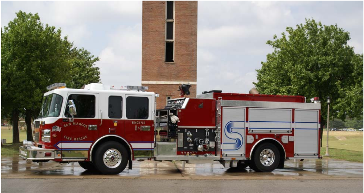
The new SMEAL Pumper/Engine at Station 3 on Hunter Road