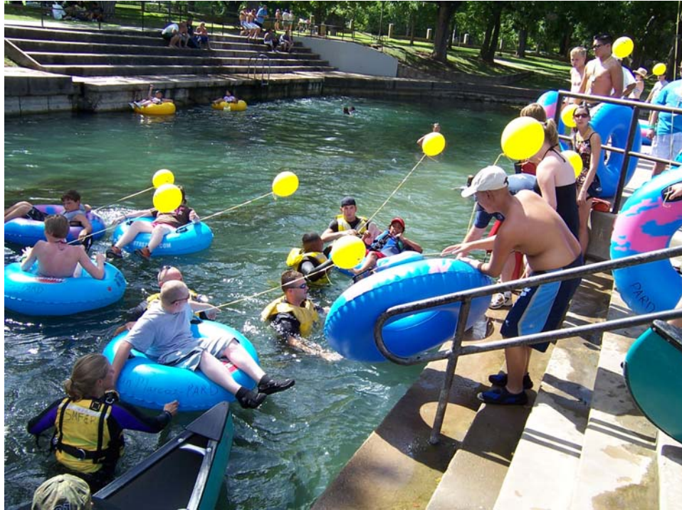
San Marcos Firefighters help the Sun Shine Kids enter the San Marcos River for a float during the Annual Texas Hill Country Adventure.