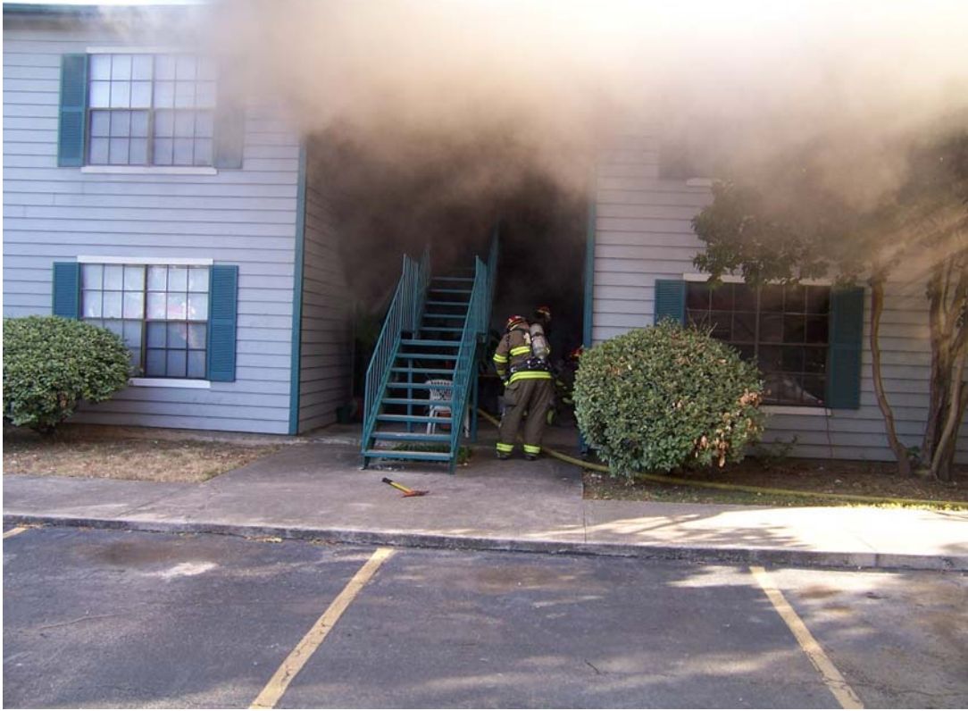
San Marcos Firefighters enter a burning apartment to extinguish a fire that damaged two apartments at the Verandah Apartments on North IH 35.