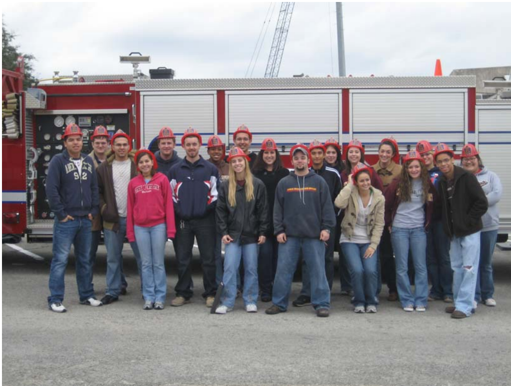
Texas State University – San Marcos Residents Advisors (RA's) graduate from the 4 th SMFR RA Fire Academy