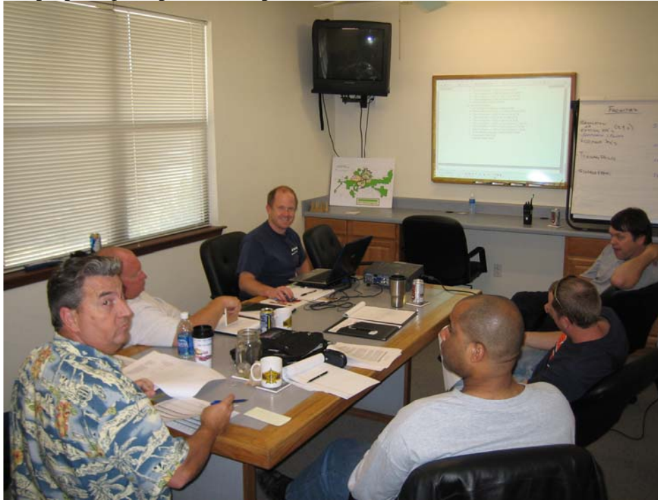
SMFR Strategic Master Plan Committee

/// FIRE LINE - DO NOT CROSS /// FIRE LINE - DO NOT CROSS /// FIRE LINE - DO NOT CROSS ///