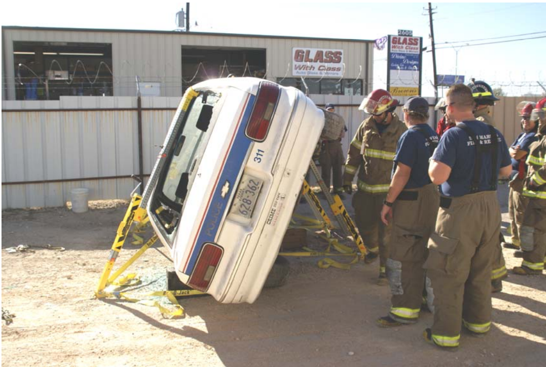
Firefighters train on motor vehicle accident stabilization techniques using Rescue Jack stabilization tools recently purchased by the Department