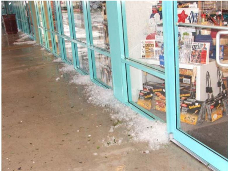
A severe Hail Storm caused damage to buildings and vehicles at the Outlet Malls and other parts of the city.

Our Smoke Detector Hot-Line number is 512.393.8484.