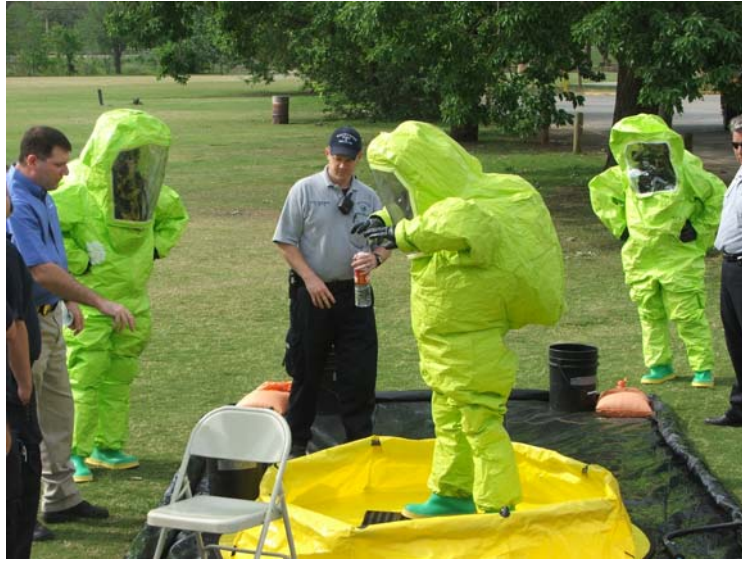
Firefighters train in total encapsulating Haz-Mat suits at City Park